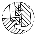
Body Seat Screwed in