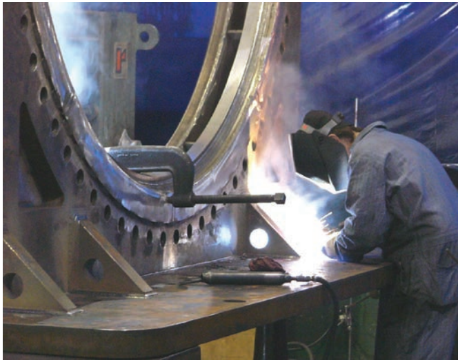
96" Bonneted Knife Gate Valve

Pratt Knife Gate Valves can be manufactured to meet Buy America requirements under state and federal laws. Our sales team will assist you in getting your project under contract and into construction. We will provide quotations itemizing quantification of material percentages, availability, and prices for domestic and qualified foreign materials that Henry Pratt Company uses in manufacturing knife gate valves (KGVs) to meet your project specifications. All of our valves can be completely manufactured in America by our skilled craftsmen in Kimball, Tennessee. To meet Stimulus financial requirements or other Buy America clauses, we are able to source U.S.A. manufactured steel and stainless steel materials. We can always provide you with the right valve for any project.